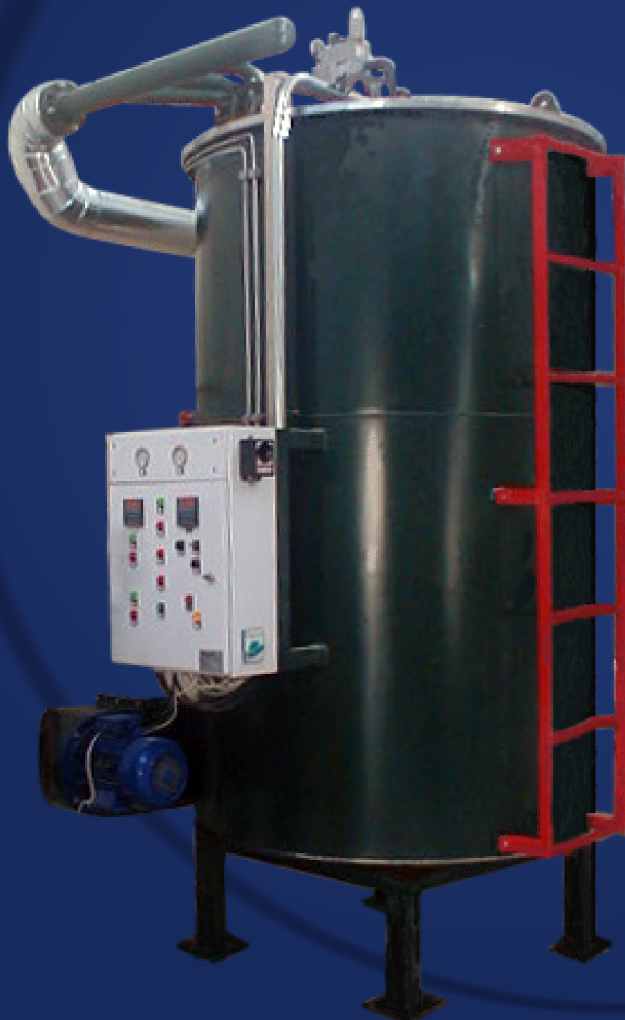
Hot Oil Boiler